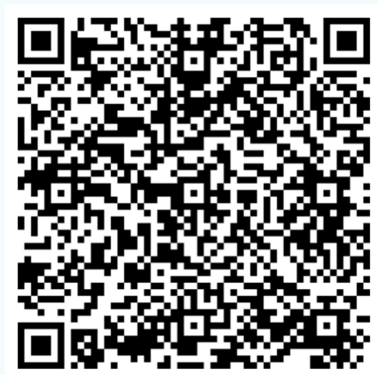
Movement disorders referral form

Our expert team offers advanced endovascular therapies for brain conditions, utilizing the latest technology to deliver safe and effective treatment.