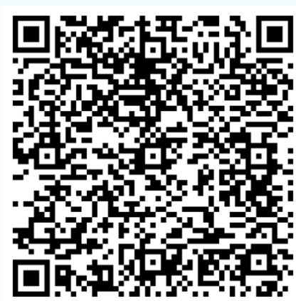
Neurosurgery & spine care referral form