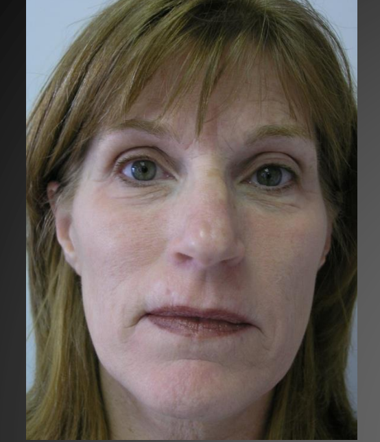
1 Day Later