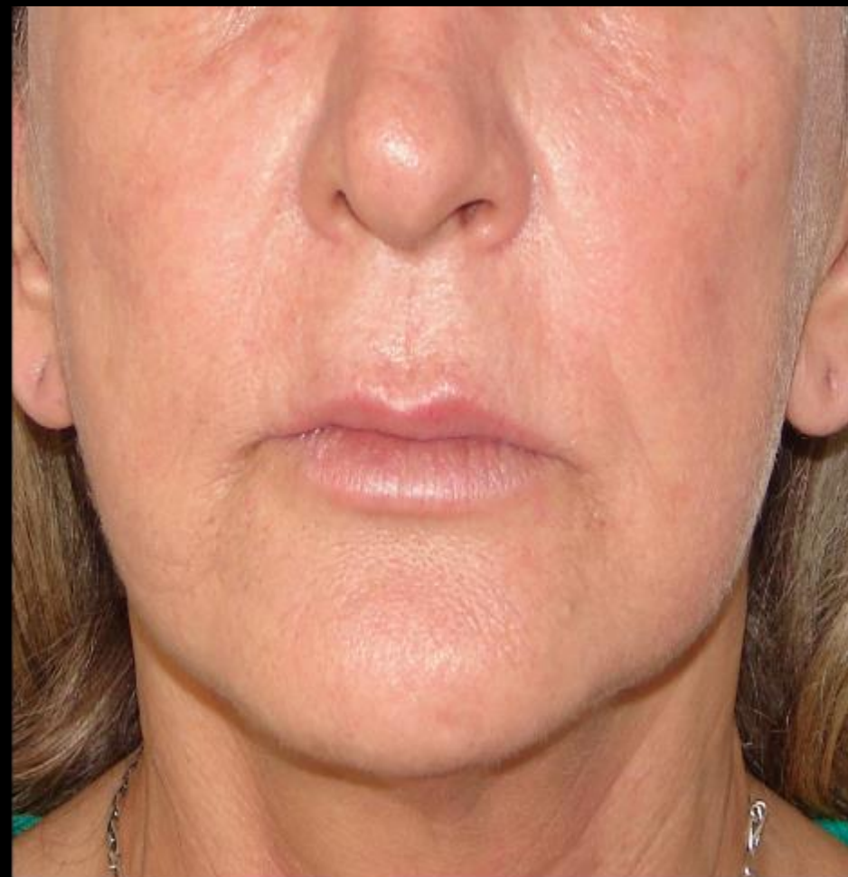
after 3 treatments