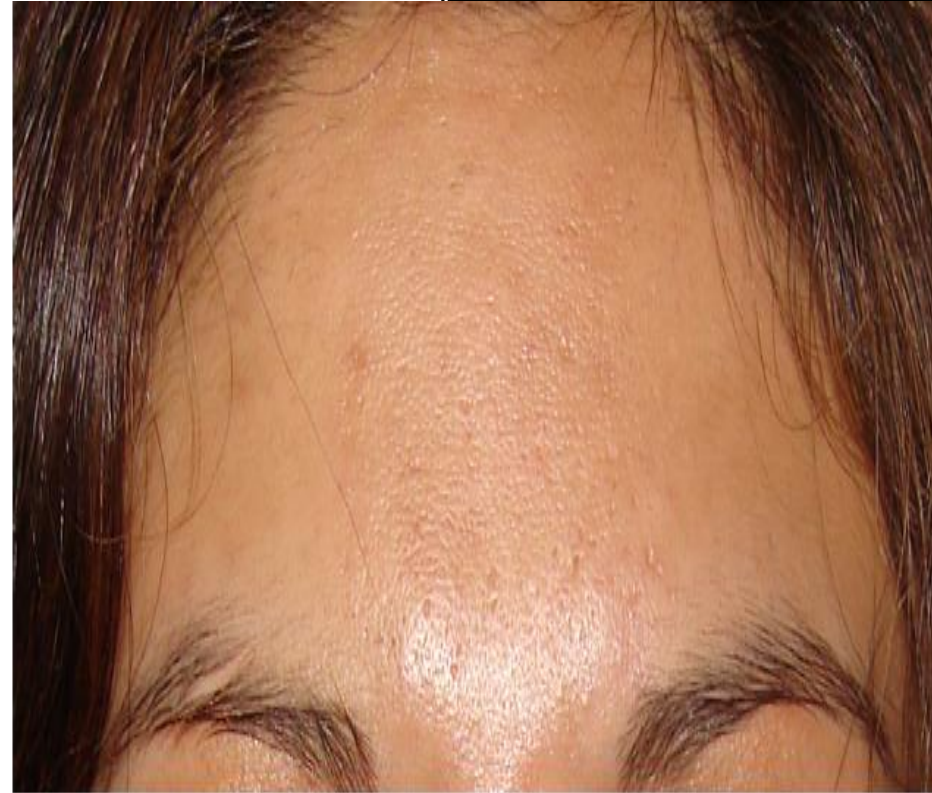
after 2 treatments