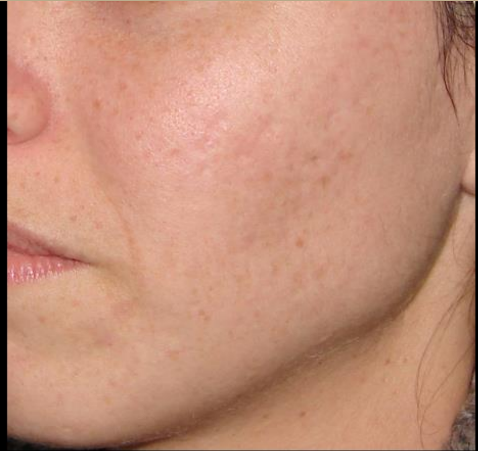
after 3 treatments