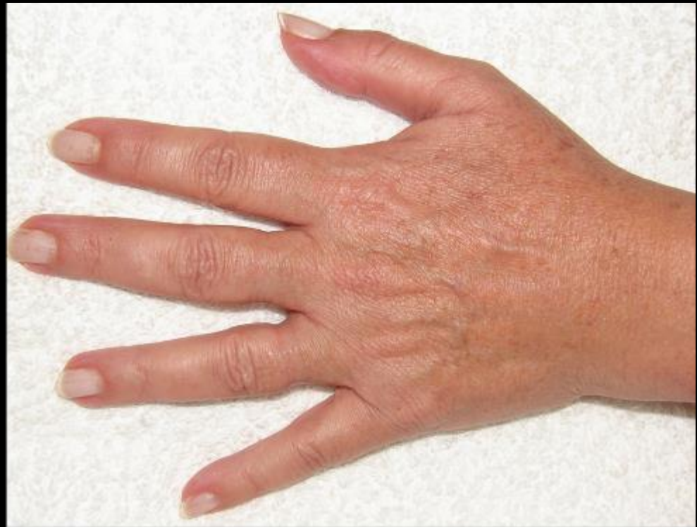
after 1 treatment