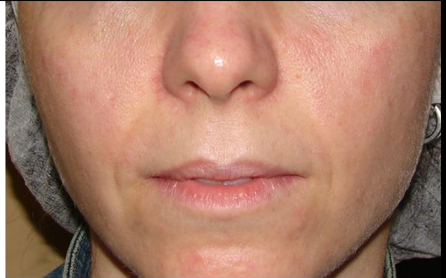
after 4 treatments